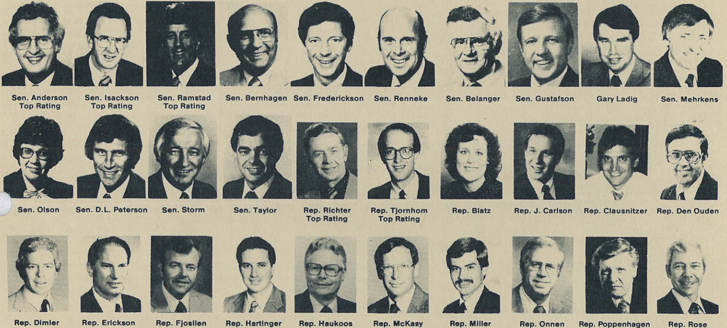
Sen. Anderson Top Rating Sen. Isackson Top Rating Sen. Ramstad Top Rating Sen. Bernhagen Sen. Frederickson Sen. Renneke Sen. Belanger Sen. Gustafson Gary Ladig Sen. Mehrkens

The Legislative Evaluation Assembly of Minnesota, Incorporated (LEA), is a non-profit, non-partisan corporation established to keep the citizens of Minnesota informed of both important legislation and the voting performance of each Representative and Senator in the Minnesota State Legislature. LEA bases its evaluations on the traditional American principles of constitutionalism, limited government, free enterprise, legal and moral order with justice, and individual liberty and dignity. LEA conducts its analysis and all its other activities solely with voluntary efforts and has no income other than from donations and the sale of its reports. Your donations and orders are needed to make it possible for LEA to continue its work. LEA encourages the usage of the material in this Report, in whole or in part, by any group or individual.